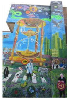
A Brief Moment in Time