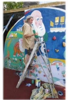
Tableaux of Charles Darwin